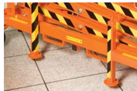
Fork lift points if required to move across site