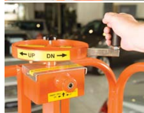
The Powerscissor is simple to operate – turn the handle up or down to gain desired height (pictured bottom), or by electric power drill, with supplied attachment (pictured top)