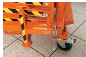
Lockable Castor wheels