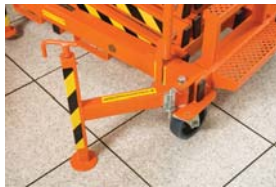
Outriggers can be deployed quickly - can be positioned for access against walled areas