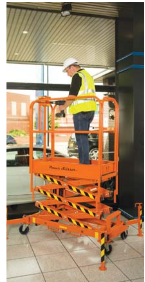
Platform can be placed in a number of positions to reach the ideal working level

Product specifications are subject to change without notice or obligation. The photographs and/or drawings in this document are for illustrative purposes only. Refer to the appropriate Operator's Manual for instructions on the proper use of this equipment.