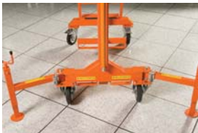
Two outriggers can be deployed quickly - can be positioned for access against walled areas