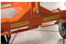
Fork lift points if required to move across site