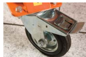
Lockable Castor wheels