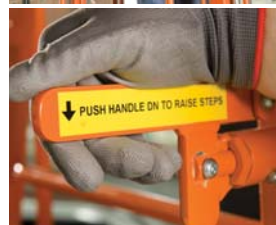
The PowerStep is simple to operate – push the handle at base to gain desired height (pictured bottom), press handle from within platform to lower (pictured top)