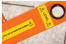
Tilt sensor enables you to check you're on a flat, level surface